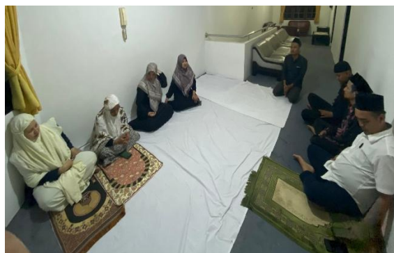
(b) Kuliah tujuh menit after prayer