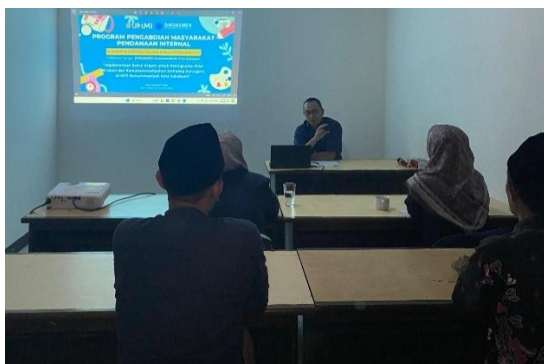
(a) Providing material in class

In this Baitul Arqam activity, participants are also required to pray 5 times a day congregation, take turns giving 7 minutes preach ( kuliah tujuh menit ) after prayers, and night prayer ( tahajjud ). In the morning, they do sports together and there are games to improve cooperation and collaboration. The documentation of Baitul Arqam activities are depicted in Figure 1.